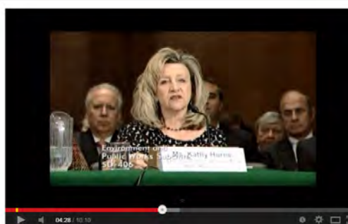
Alabama Rural Water Association before the Senate Environment and Public Works Committee (Safe Drinking Water Act funding)