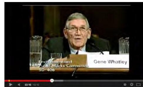
Oklahoma Rural Water Association before the Senate Environment and Public Works Committee (Safe Drinking Water Act regulations)