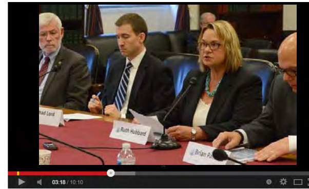
Minnesota Rural Water Association before the House Interior Appropriations Subcommittee (EPA Appropriations, State Revolving Funds and Safe Drinking Water Act)