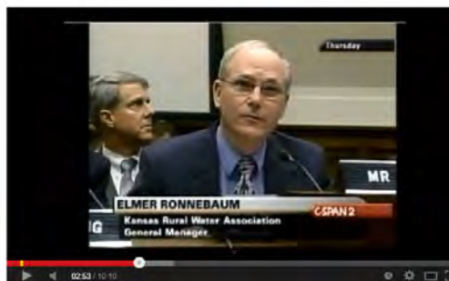
Kansas Rural Water Association before the House Energy and Commerce Committee (Safe Drinking Water Act funding)